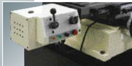
Accessory: X-Axis power feed, 0–1000mm/min, with feed limit switches (Stock no. 50000055)