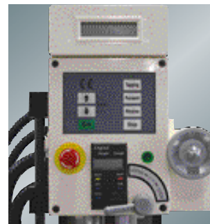
Digital display for spindle speed and spindle travel